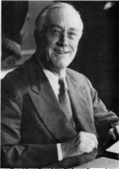
President Franklin Delano Roosevelt.

some form of nationwide flood control administered by an agency of the federal government, and that it should be financed in some measure by federal funds. This left five specific areas of disagreement: the degree to which the flood control effort should be linked to a larger multipurpose river basin development program; the agency that should administer the program; the proper division of costs between the federal government and the state and local interests; the advisability of combining watershed soil conservation pro-