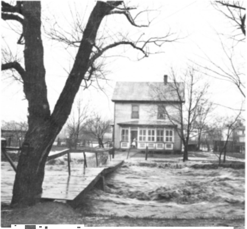
Swollen mountain stream threatening a valley home in West Virginia, March 1936.