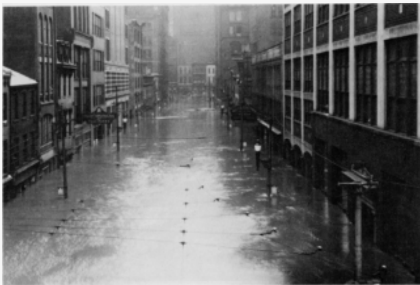
Duquesne Way and 9th Street, Pittsburgh, Pennsylvania, 18 March 1936.