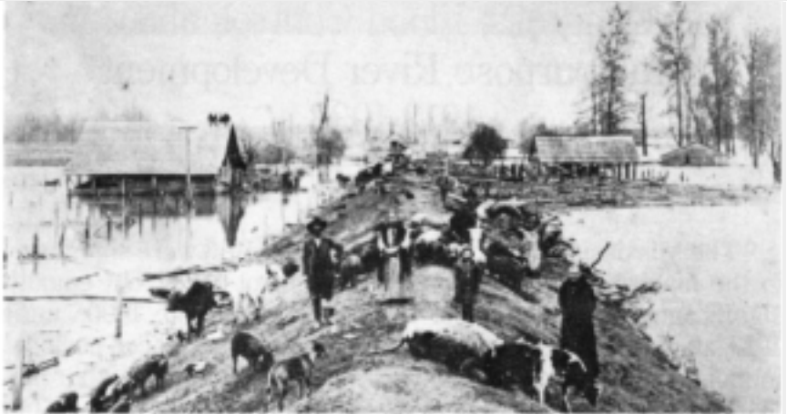
Refugees and livestock on a levee during the Mississippi River flood, 1912.

Newlands, and a brilliant group of conservationists who worked closely with him, convinced President Theodore Roosevelt that traditional rivers and harbors navigation projects should not be considered separately from other possible water resources uses. In 1907, the year of the great Pittsburgh flood, Roosevelt appointed an Inland Waterways Commission to study the entire question of water resources. The commission, guided by Newlands and his associates, recommended that the federal government undertake a coordinated program of multipurpose river development under the control of a permanent commission appointed by the President. 4