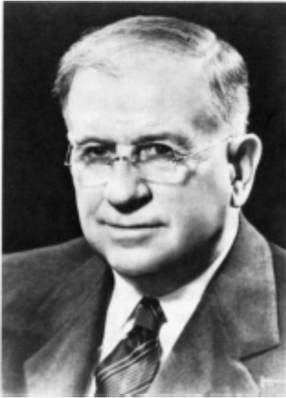
Harold L. Ickes, Secretary of the Interior, 1933-1946.

on the lower Mississippi, who received flood protection. The theme of multipurpose development was refined by Norris during his long fight in the 1920s to develop the Tennessee Valley. 17 In 1932 Norris left the Republican party to campaign for Roosevelt. The two became good friends and political allies throughout the New Deal, and Norris often served as an administration spokesman in Congress. In January 1933, a short time before his inauguration, Roosevelt announced his support for Norris's Tennessee Valley program. The TVA bill was