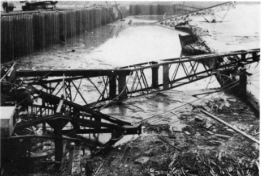
Flooded cofferdam at Emsworth Lock, Ohio River below Pittsburgh, 24 March 1936.