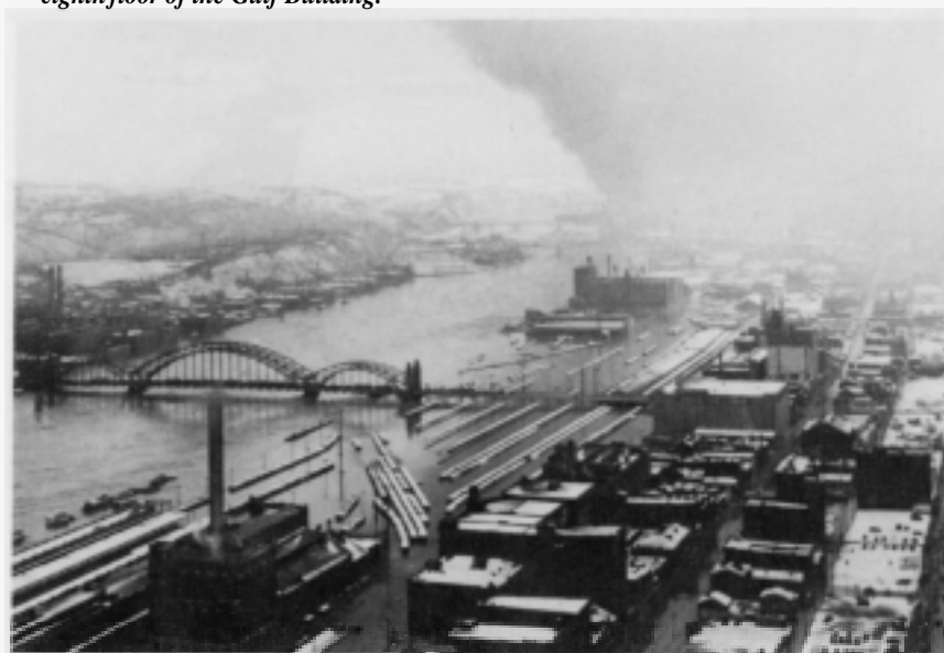
Allegheny River at Pittsburgh, Pennsylvania, 18 March 1936, viewed from the thirty-eighth floor of the Gulf Building.