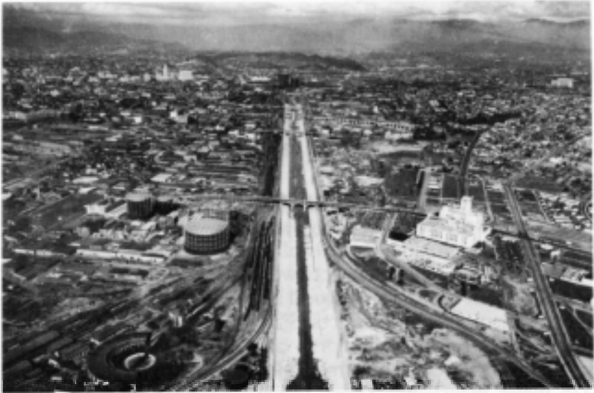
One result of the 1936 Flood Control Act: a concrete flood control channel to help prevent the Los Angeles River from flooding metropolitan Los Angeles. The city hall is in the background at the left. This picture was taken in 1941.

Charles E. Merriam were men of vision and intelligence who should have accepted the fact that pork barrel legislation was a factor in the American democratic political process — especially in a presidential election year. President Roosevelt's public statements about using the NRC to scrutinize the pork barrel projects on rivers, harbors, and (after 1936) flood control legislation only stiffened congressional resistance to the agency. By the end of the 1930s, even the Republicans had abandoned the NRC, seeing it more as an example of presidential authority than as a deterrent to irresponsible spending. Its elimination by Congress in 1943 was part of a general reaction against the whole concept of centralized federal planning in which the rivers-harbors-flood control bloc was only one factor. 1